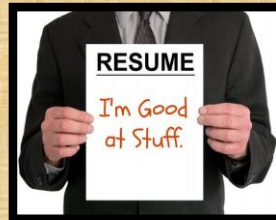
Have your resume reviewed by an SNR Academic Advisor!

Presented by the Natural Resources Alumni Association