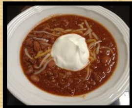
Free Chili Meal (While Supplies Last)

The Q&A session with a panel of professionals representing all degrees in SNR will begin at 5:30pm followed by a chili dinner and more conversations with professionals in your field!