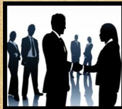
Network with professionals!